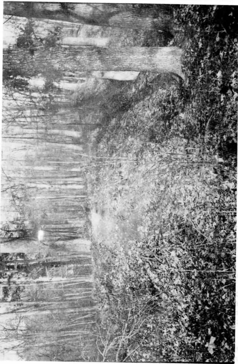
Part of the surviving earthworks of Fort Heiman.